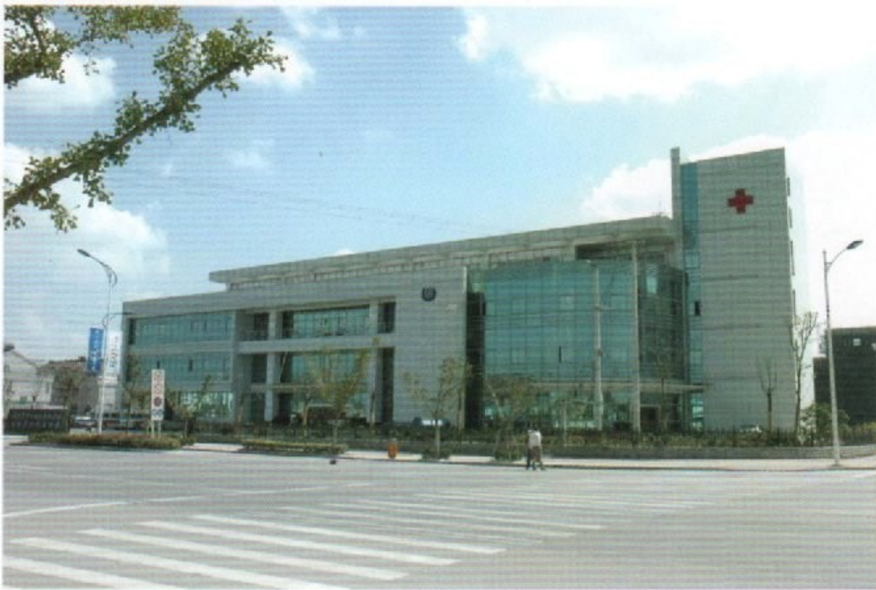
Jiangsu-Taicang First-aid Center

operating room and asepsis room of the hospital asepsis room of cosmetic, grocery ,electron laboratory and so on school,hotel,exhibition room and so on equipments with high requiring for antibacterial laboratory with high requiring for antibacteria